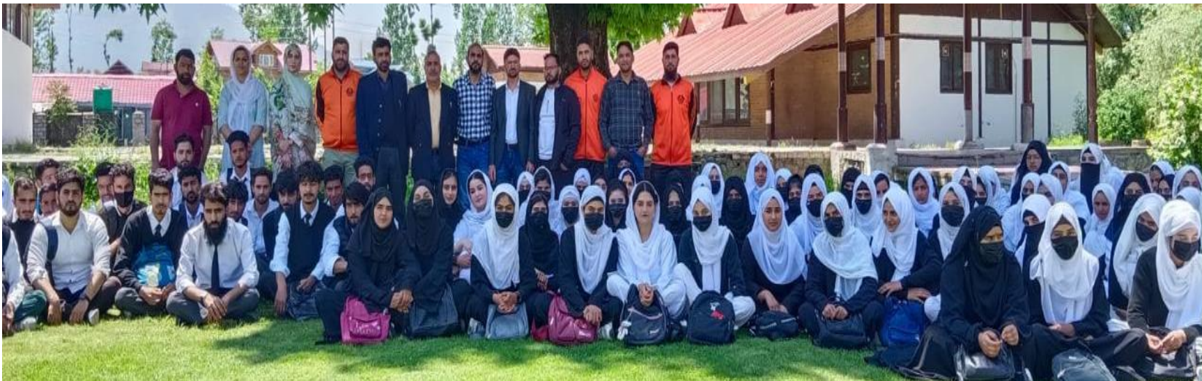
GOVT. DEGREE COLLEGE, QAZIGUND